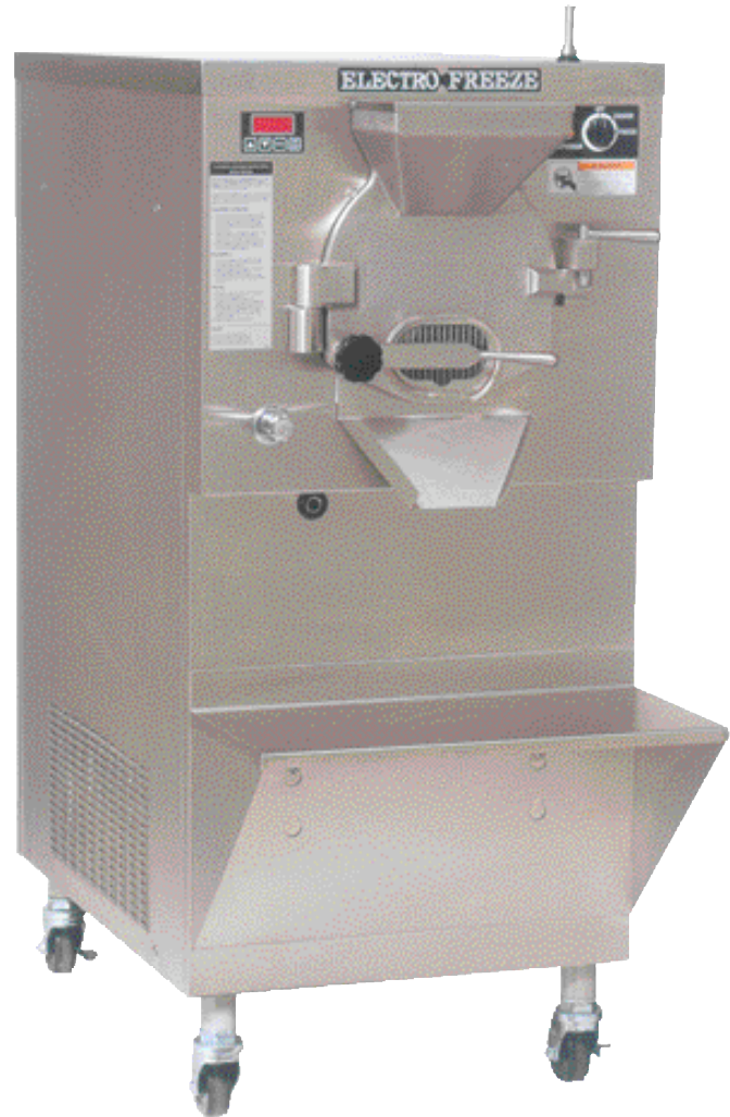
Model B12 Model B24

Electro Freeze... Quality since 1929. See our complete line of frozen treat machines, including Soft Serve, Shake, Slush, Batch, Yogurt, Custard, Whipped Cream, Granita and Arctic Swirl Flavor Blender. Because we give you a choice!